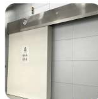
Neutron Shielding Door